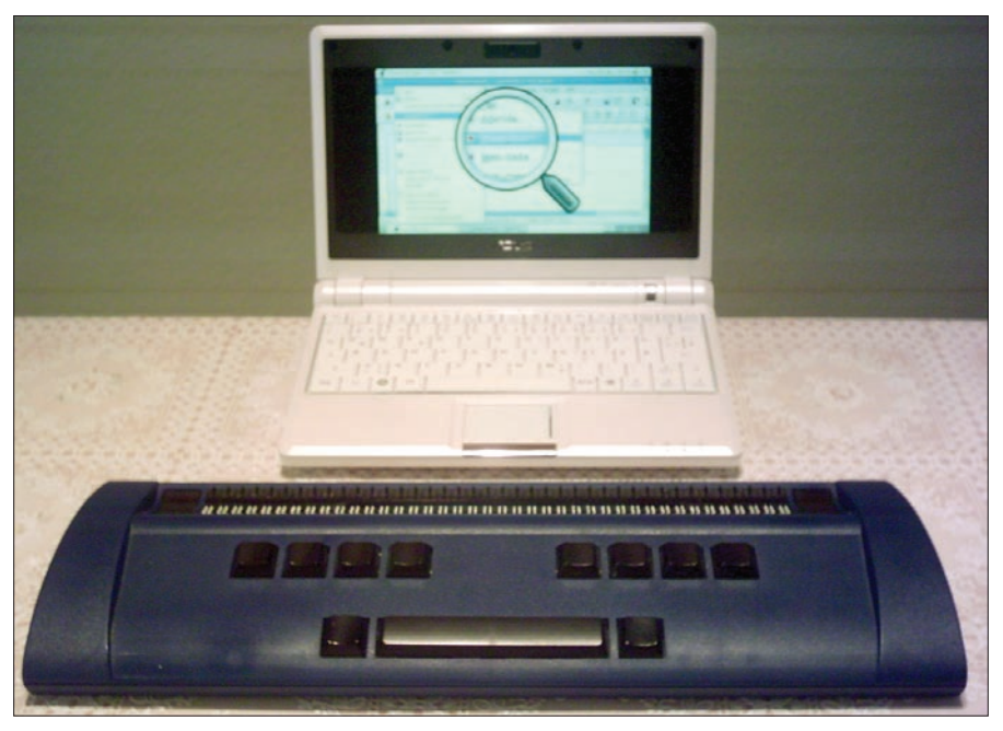
Figure 6: Adriane brings barrier-free computing to the low-cost EeePC laptop.

The Adriane system is available on the Knoppix Live CD or DVD starting from