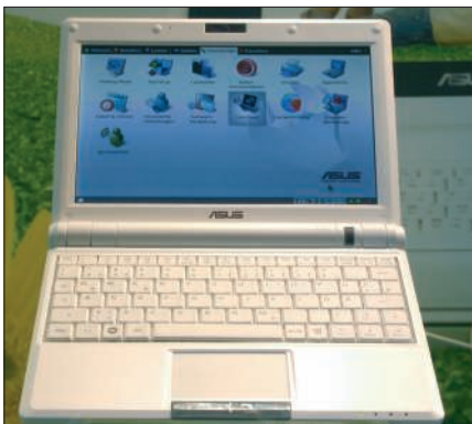
Figure 1: The Eee PC with Linux operating system – safely stored in a showcase.

Because normal touch screens cannot handle multiple mouse pointers, Schmitt has developed custom applications, including a mind-mapping program and an on-screen keyboard. ■