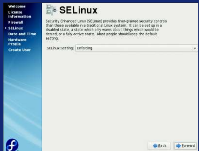
Figure 4: SELinux provides mandatory access control.