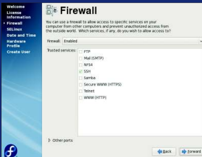
Figure 3: Manage your firewall from a handy user interface.