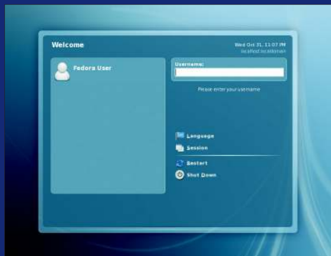
Figure 1: Logging in is easy with Fedora 8.

Red Hat engineers and an active open source development community help to make Fedora 8 a feature-rich, user-friendly distribution with everything you need to access the web, create office documents, play music and videos, manage photos, play games, and more. We hope you enjoy this month's Linux Magazine DVD. ■