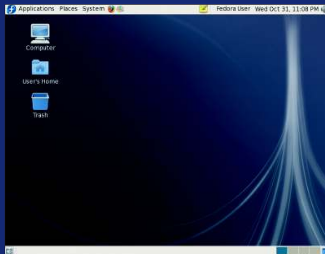
Figure 2: The Fedora art team turns out another stylish desktop.