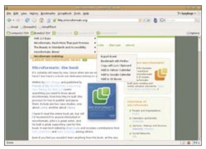
Figure 4: Operator is a must-have Firefox extension that can manipulate microformatted content.