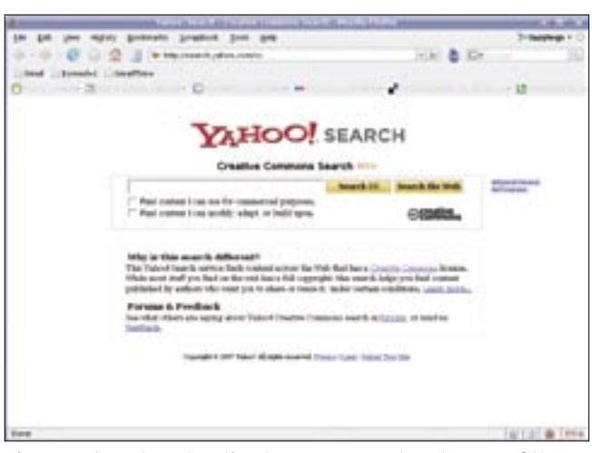
Figure 1: The Yahoo! Creative Commons search makes use of the Rel-License microformat.

<a rel="license" href="http://z creativecommons.org/licensesz</pre>