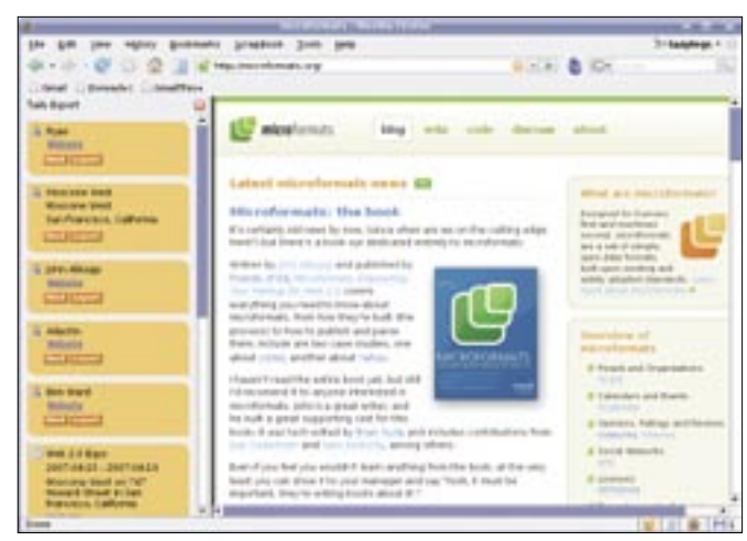
Figure 5: Tails is another Firefox extension that can come in handy when dealing with microformats.

title="52.51191;13.38519"> Mohren strasse</abbr>