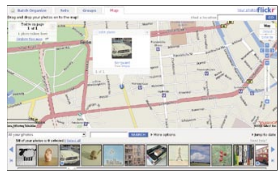
Figure 3: Flickr uses the geo microformat for geocoding photos.

A microformat-ready browser that encounters the hCalendar format can seamlessly integrate the data with other calendar and event information. The so-called abbr design pattern is used in the formatting to embed data without making it visible on the page. In this case,