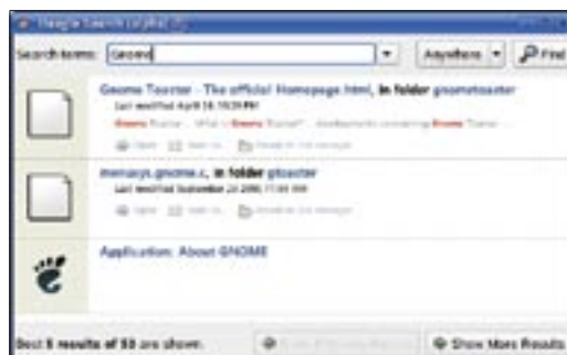
Figure 1: The Best search program showing the results for the "Gnome" query.

To allow a Beagle client application to pass a query to the Beagle daemon, older Beagle versions (such as the ver-