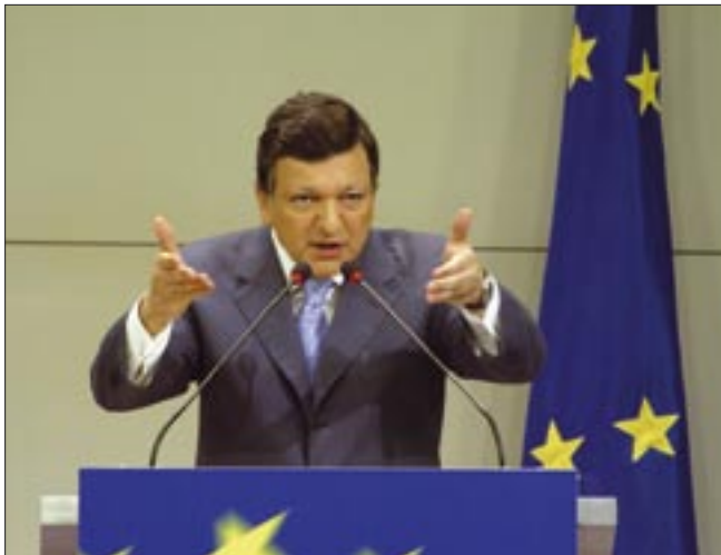
Figure 3: While José Manuel Barroso, the President of the European Commission, is fighting for a common constitution for all EU member states, the members of the community devoted their time to promoting software projects in executive committees.

integration, and this means that so-called consortiums of at least five independent partners from at least three countries are required to apply.