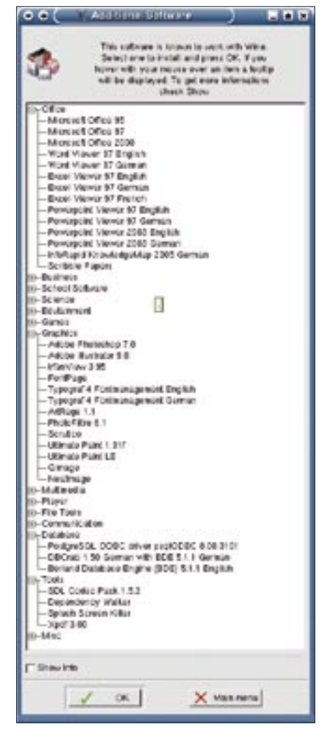
Figure 2: Wine is known to work with a variety of Windows applications.

copies a template file. Incidentally, Wine does not support the original Windows Registry file. Instead, Wine uses a cleartext format, storing the system and user Registry hives in the system.reg and user . reg files. As programs do not typically access the Registry directly, but take the recommended approach via system calls, this is a good way of making the Registry database easier for humans and machines to read and modify.