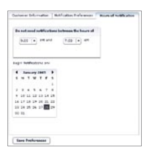
Figure 4: Flash Forms give you greater control over how users input their data.

Servlet applications while converting to CFML. You can incorporate CFML functionality into your existing JSP applications, for example, to take advantage of ColdFusion's charting or business reporting features. Conversely, if there are certain operations best performed by a JSP or a Servlet page, you can incorporate that functionality into CFML applica-