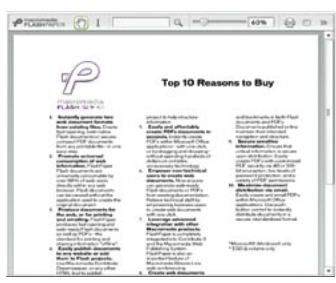
Figure 2: An example of a FlashPaper document embedded in a web

bars rising from the x-axis to the correct data point on the graph or pie charts fading into view. Each chart format allows for clickable area maps, which gives the user the power to assign URL values to chart segments. This feature gives you the possibility of creating drill down charts for Management Information Systems (MIS) or Decision Support Systems (DSS). ColdFusion offers many other chart type options. For instance, you can choose to include line, bar, pie, and scatter charts