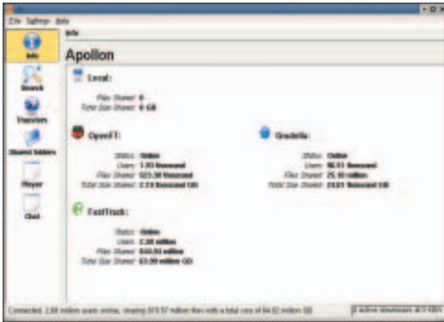
Figure 2: Several million users share files all over the world.

Fasttrack, Gnutella, and OpenFasttrack. As Arkollon contains and compiles the source code, you need the KDE developer environment. Table 1 gives you a list of required packages; the package names may vary with RPM-based distributions.