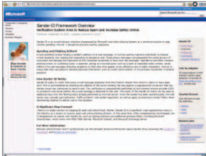
Figure 2: Even though the idea of a sender ID may seem to make sense at first, it is fraught with danger due to the Microsoft patents on the method.

Although Mark Martinec recommends Postfix [10] as an MTA in combination with Amavisd-New, the program will