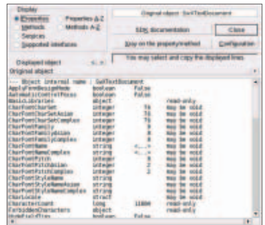
Figure 3: The Xray macro is useful for troubleshooting. It displays UNO object properties in Basic.

The String() method gives us the raw text for an element. Basic uses a loop construction that starts with Do and