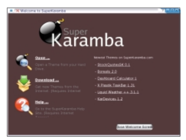
Figure 1: The SuperKaramba welcome screen takes you to some important places.

Clicking Help... will take you directly to the program help page, if you have an Internet connection; Download... takes