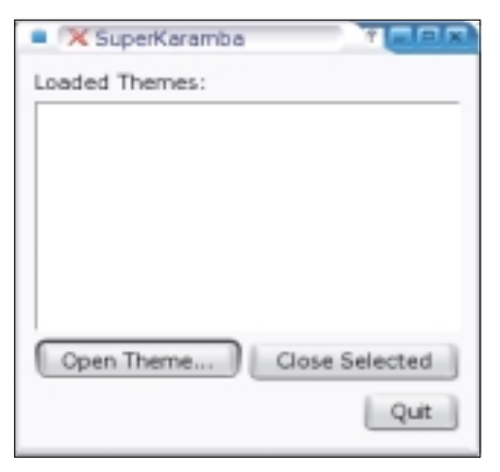
Figure 2: Opening a theme in SuperKaramba.

you to the application's official themes page (direct links to the current themes are also listed in the right-hand panel); and clicking Open... allows you to load the Superkaramba themes on your computer.