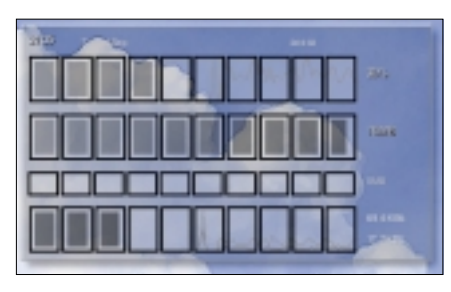
Figure 3: All the information you need in pretty packing.

As you can see in Figure 3, the theme shows you the system time, the CPU usage, or the memory load. Just like any other theme, it seamlessly adds trans-