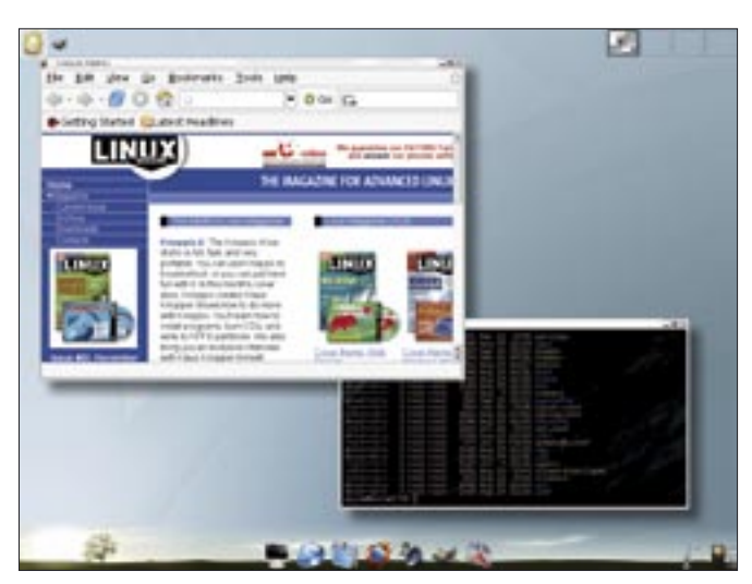
Figure 4: Elive comes with the very fast and attractive Enlightenment 17 window manager.

one the most powerful live distributions; it is fast and easy to install, and the range of editions cover a range of user needs, with some small problems related to the distro's young age.