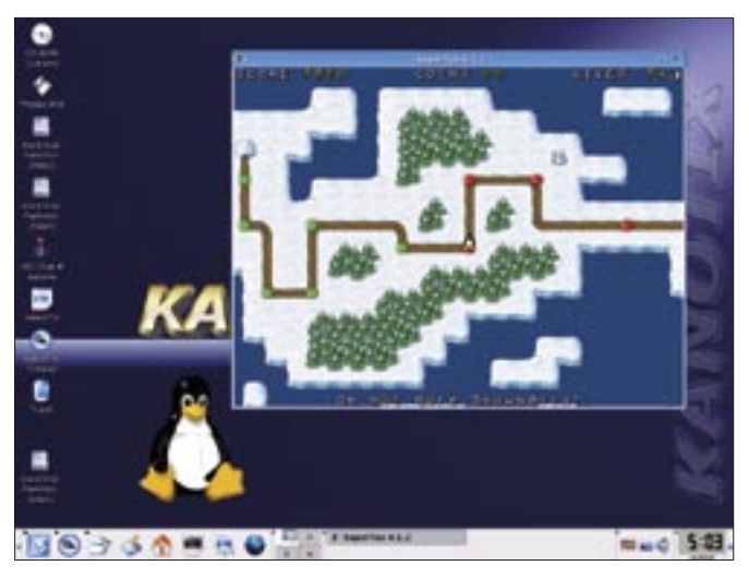
Figure 7: Like Knoppix, Kanotix comes with lots of vintage games.

features to Debian). Gnoppix is primarily a live version of Ubuntu Linux, but at least that makes it a good tool for testing whether your system supports Ubuntu.