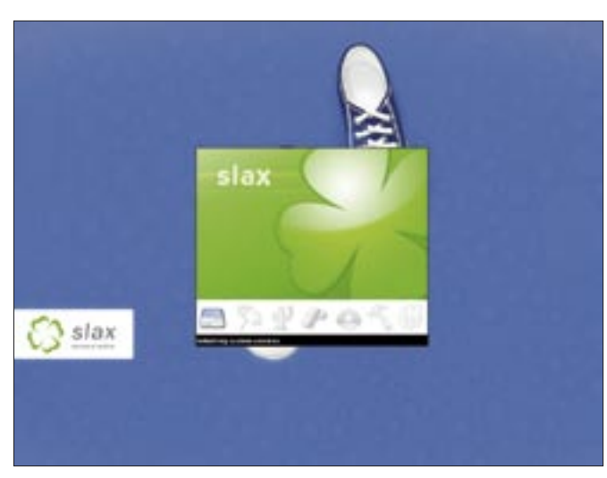
Figure 2: Slax is a clean and fast live Linux system with a very small footprint.

small Linux versions from the same base system. At the moment, four versions of Slax are available. (A total of seven are planned.) All the Slax versions have a size smaller than 185 MB, which means that Slax fits on a Mini CD. The current versions of Slax include: