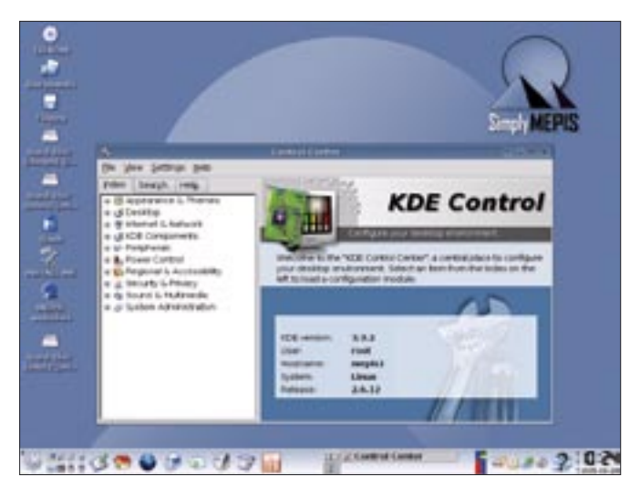
Figure 3: The simple and practical Mepis distribution is based on KDE.