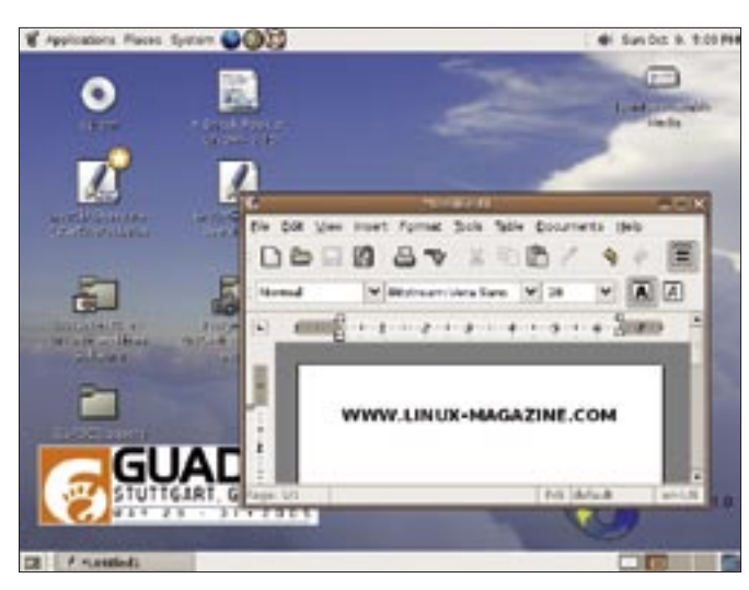
Figure 6: The Gnome-based Gnoppix distribution includes tools like AbiWord.

Thunderbird, Gaim, Skype, aMSN, K3B, Kaffeine, and Xmms.