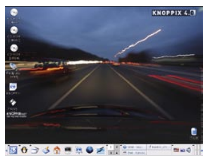
Figure 1: Knoppix 4 is a mature live distribution with a huge collection of applications.