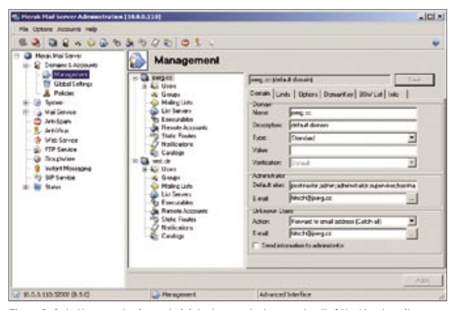
Figure 3: Only the console gives administrators central access to all of the Merak mail server's settings. The product has such an enormous range of functions that the cluttered interface can't hope to cover them all.

The Merak mail server was originally developed by a Czech software company, Icewarp [8], and the same people developed the virus scanner used by the Merak mail server. The GUI supports the AVG, F-Secure, and McAfee engines. You