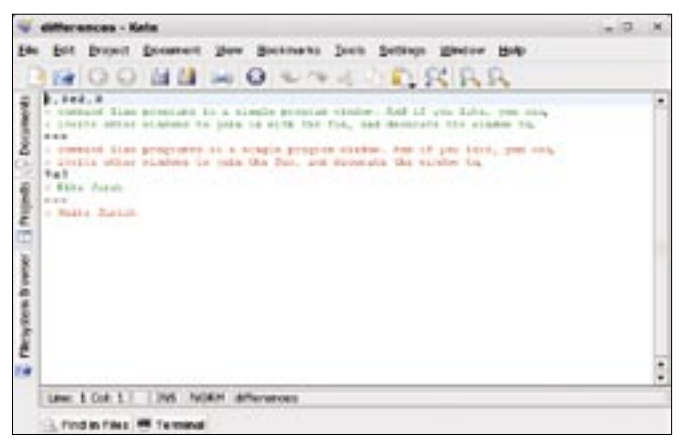
Figure 2: Syntax highlighting makes Diff output much easier to understand.