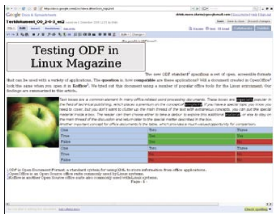
Figure 4: Writely is no worse than the offline contenders, but it displays the elements as an HTML page rather than a text document.

display the reference document in an A4 frame, but rather distributed it over the whole width of the screen. Because the office software resides on the server, it is difficult to know whether the application might be changing over time, but when I first tried to open the document, I got a result similar to the recreation shown in Figure 4. When asked to print the results, Writely squashed the whole of the document onto a single page.