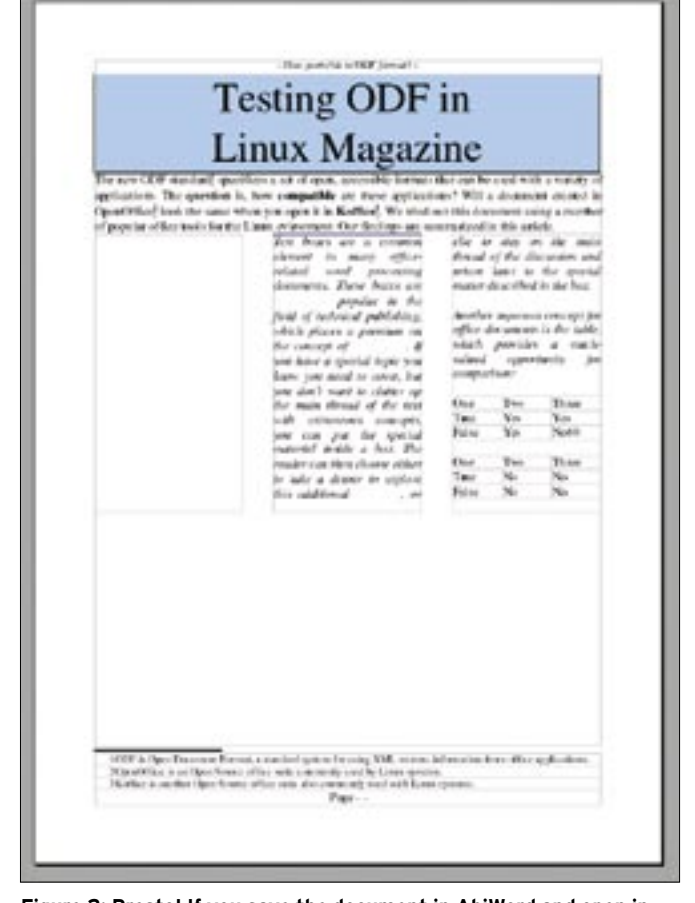
Figure 2: Presto! If you save the document in AbiWord and open in OpenOffice again, you end up with something resembling a completely new document.