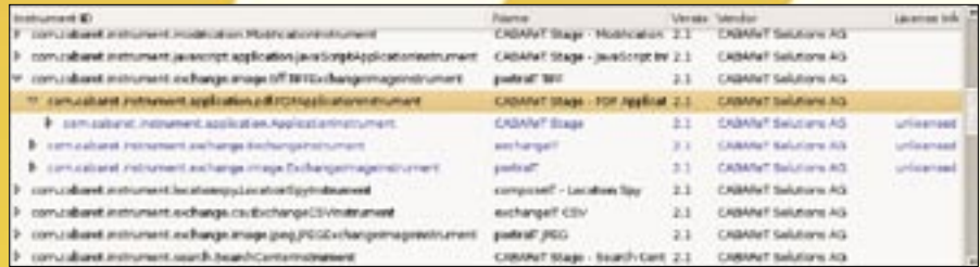
Figure 3: Cabaret Stage highlights unlicensed instruments in blue in the overview.

Hovering the mouse over an icon pops up a tooltip. The developers are aware of the fact that some icons do not scale properly, and work is in progress to remove the bug.