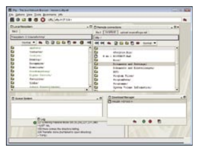
Figure 1: The Java-based JFtp client program gives Vista the ability to access NFS servers, along with SMB, FTP, or SFTP services.