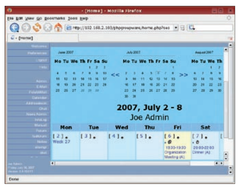
Figure 1: phpGroupWare lets you display the available tools in a menu on the left side of the screen.

Several different themes display icons and text either at the top of the window or on the left side. In some cases, you can choose text, icons, or even both. Typically, when the icon bar is at the top, module-specific menus are on the left. With the theme I chose, applications are accessed through the menu on the left side of the screen, as you can see in Figure 1; if too many applications are assigned to the user, they do not all appear in the menu.