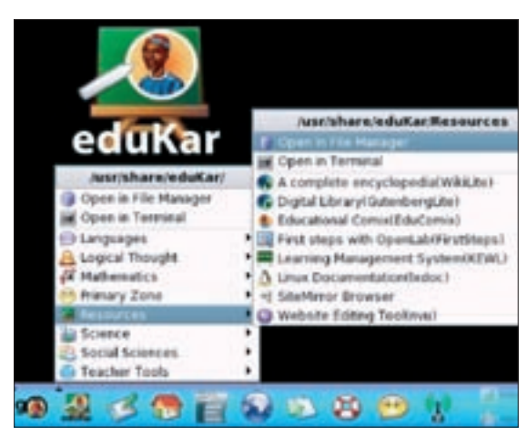
Figure 1: With EduKar, the "Hai Ti!" comics are only two mouse clicks away.

OpenLab includes the first three issues in its EduKar educational software suite