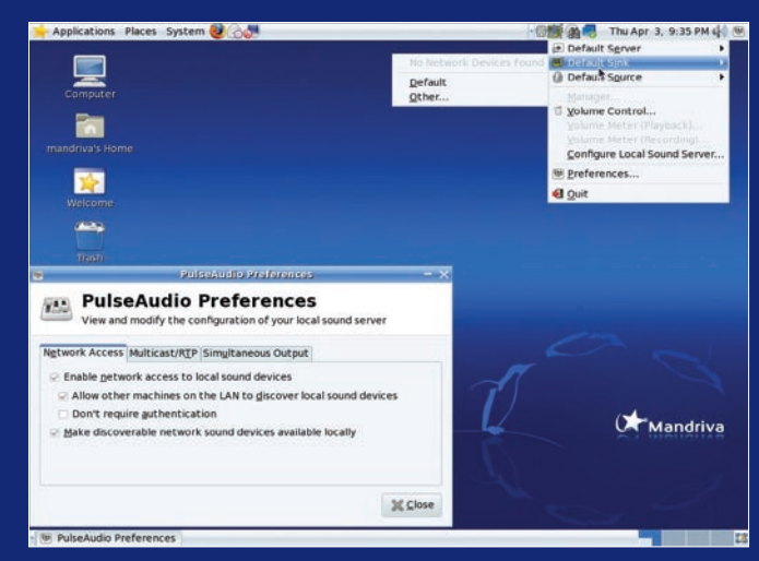
Figure 2: You can manage sound streams and sound devices with PulseAudio.