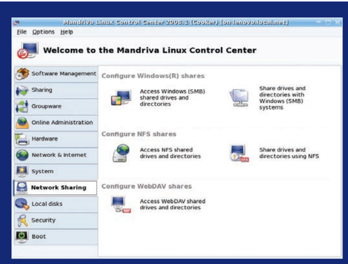
Figure 3: The Control Center is a central spot for configuring your Mandriva system.