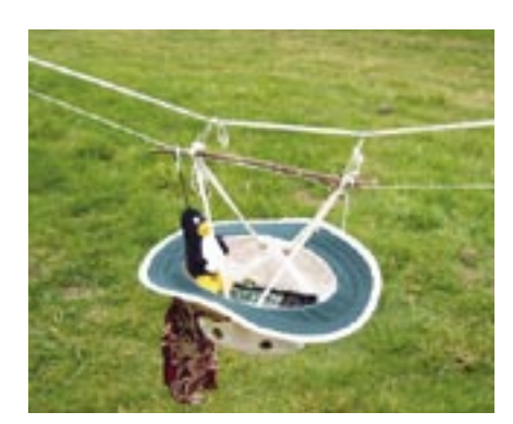
Figure 2: Transferring data over a piece of wet string - the geeks found some creative solutions.

The Linux Bier Wanderung 2005 was a huge success greatly enjoyed by every hacker, hiker, and monster hunter. ■