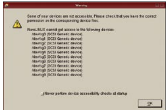
Figure 2: Nero complains about being unable to access the SCSI systems, although the laptop used for the test does not have any.

Recent changes to Nero include support for layer-jump recording of DVD-R-DL (Dual Layer). This feature gives users the ability to fill dual-layer DVD-Rs in multiple sessions – the burning program writes both layers of the disk alternately.