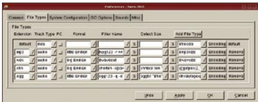
Figure 4: This untidy dialog lets users introduce the Nero audio converter to other formats.