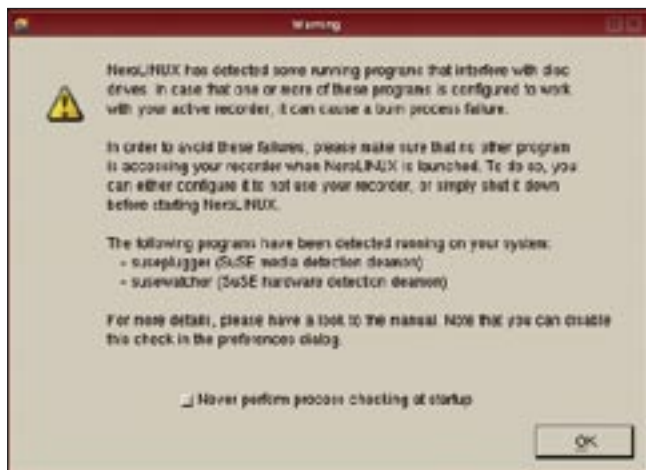
Figure 3: Nero will not cooperate with some of the features of modern Linux distributions.

version. But compared with Linux applications such as K3b [3], Nero also leaves a lot to be desired. The program does not have a project wizard, and although drag & drop works within Nero and from and to Konqueror, you have to make sure you select the right target. The filesystem tree area at the bottom left of Figure 1 just ignores any attempts to drop files and directories, forcing users to use the file list to its right.