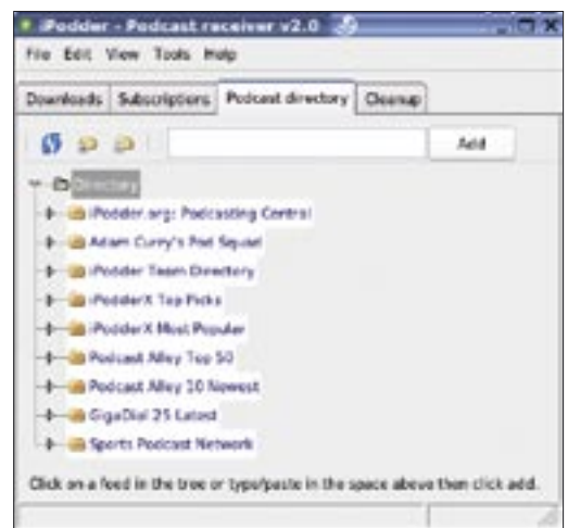
Figure 2: The Podcast directory tab offers a choice of subscription options and also lets you manually enter an address.

bp.conf is a simple text file listing the urls of feeds, one per line. You can edit bp.conf by hand, but if you do, remember to hit return at the end of the last entry because the script will not parse a line if it does not end in a newline character.