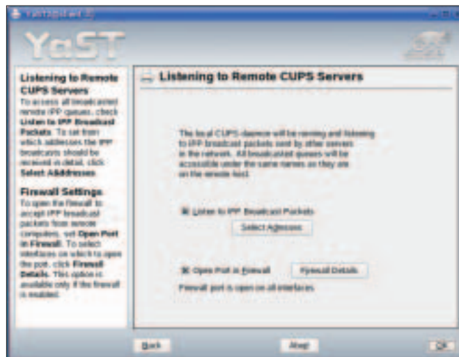
Figure 4: Add the IPP-Client to the list of allowed services.

But still, the Beagle tool, which was written in Mono and is a mixture of locate and grep , turned out to be quite reliable and quick in our initial testing. As the service is disabled by default, you first need to create an empty .runbeagle file under Gnome before you can start searching. There is a separate plug-in for Firefox-based web searching.