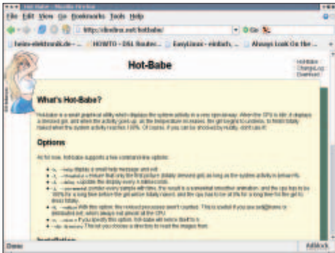
Figure 3: The controversial Hot-Babe utility reveals more than just system activity.

print acts as a wrapper that Mutt calls when printing. Muttprint accepts the printout data, processes that data, and sends the results to the printer. After installing the program, it is business as usual for the users, as the [P] key will send a Mutt message to the printer, but the results are far more pleasing.