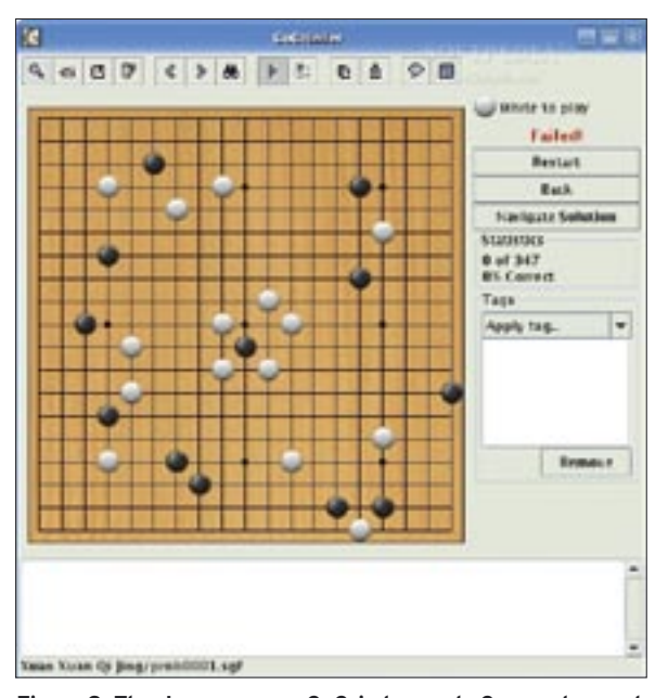
Figure 3: The Java program GoGrinder reads Go puzzles, and lets users solve them on screen.

[1] Redet: http://www.billposer.org/ Software/redet.html [2] Active Tcl: http://www.activestate. com/Products/ActiveTcl [3] Context Free: http://www.ozonehouse. com/ContextFree [4] Chris Coyne: http://chriscoyne.com/cfd [5] Scigen: http://pdos.csail.mit.edu/scigen [6] Linux GUI for Context Free: http:// dospeixos.net/projects/contexteditor [7] Internet Go Server: http://www.pandanet.co.jp/English [8] GoGrinder: http://gogrinder.sourceforge.net [9] Go problems: http://goproblems.com/ download.html [10] EFF: http://www.eff.org [11] Website with voting results: http:// www.debian.org/vote/2005/vote_002 [12] Martin Schulze's posting on Debian Sarge 3.1r1: http://www.debian.org/ News/2005/20051220 [13] Mail from Andreas Barth from the archive: http://lists.debian.org/ debian-devel-announce/2006/01/ msg00001.html [14] Official website of the Debian project: http://lwww.debian.org/ [15] Debian Social Contract: http://www. debian.org/social_contract [16] Debian Free Software Guidelines: http://www.debian.org/social_ contract#guidelines [17] Debian bug diagram: http://bugs. debian.org/release-critical/