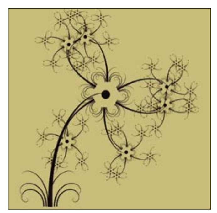
Figure 2: Context Free generates neat pictures using the theory of context-free grammars.

It has taken a while, but the first update for Debian GNU/Linux Sarge is now available, although the word "update" has to be taken with a pinch of salt. The only changes introduced to a stable Debian version are critical changes such as security patches. An update would also be acceptable if a Sarge package were completely broken.