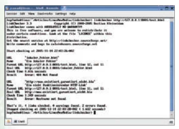
Figure 2: Finding faults: Linkchecker finds the errors in "test.html" with some help from the web server. The tool checks four links and reports that two are bad.