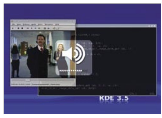
Figure 1: Transparent windows are now far quicker thanks to EXA.

This is what prompted HP's Keith Packard to design a test X server, known as Kdrive, with an architecture that does not support classical drawing operations but focuses on the functions required by today's desktops. Packard concentrated on accelerating XRender and RGBA visuals, and on keeping the server as simple as possible. Zack Rusin from Trolltech integrated this architecture, now dubbed EXA, with the current release and pro-