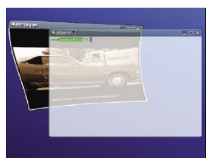
Figure 3: Xgl and AIGLX leverage OpenGL to support arbitrary window transformations.

binary format for the hard-ware drivers. X11R7 now uses standard ELF Shared Objects (.so files). The major benefit is easier porting to new architectures and easier bug hunting. Developers previously had to patch the GNU Debugger to teach GDB the special proprietary X format before starting serious work on X driver development.