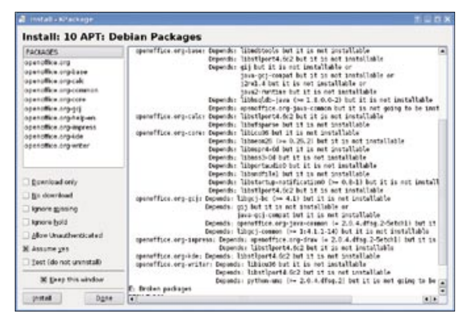
Figure 5: Kpackage works, but it is just a short trip from dependency hell.

To play your music, you can fire up the Juk music player from the Multimedia menu, load up your favorite tunes, and click the play button. While I expected an error to the effect that the file type was unrecognized, I was rather impressed to hear Smash Mouth coming from my PC speakers. I even had to turn