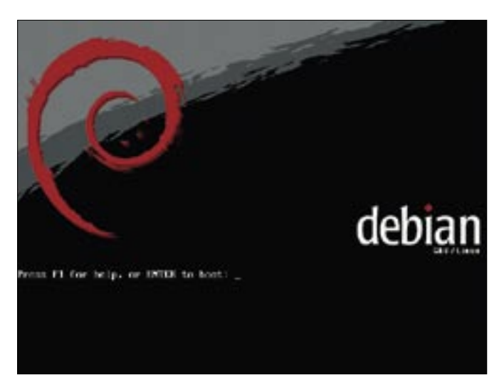
Figure 1: Simple, yet enticing. The road to Debian Etch begins here.