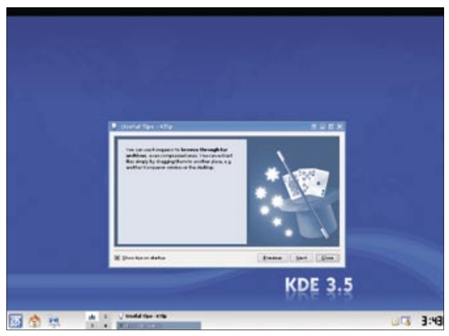
Figure 4: Your shiny new KDE desktop, courtesy of Debian Etch.

options, there's also the expertgui boot option. In both cases, the install process was pretty standard. An attempt to configure the network with DHCP failed. No surprise, since I'm not running a DHCP server. Given the option to retry, I chose to configure the network manually, which includes IP address, netmask, gateway, and of course, DNS. I gave the machine a hostname (actually, I accepted the default of debian , then I tacked on my domain name).