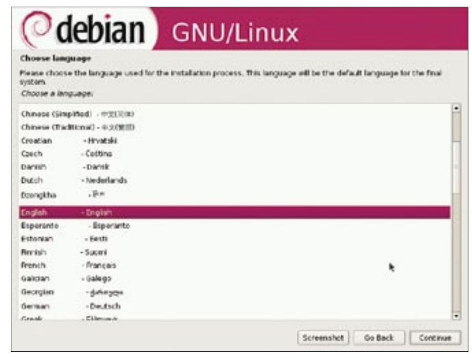
Figure 3: The much anticipated Debian graphic installer has finally arrived.

By the way, if you feel as though using the GUI takes away some of your expert