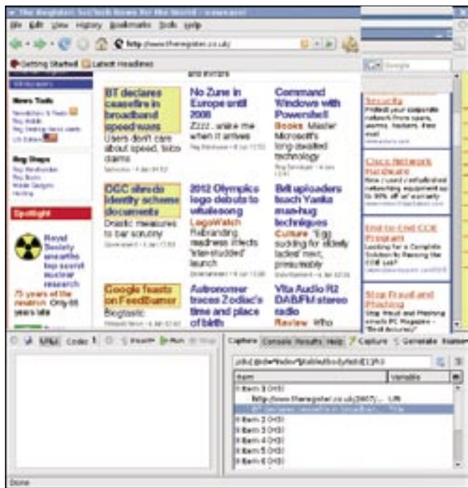
Figure 2: The Firefox Solvent extension helps users write their own screen scrapers for Piggy Bank.