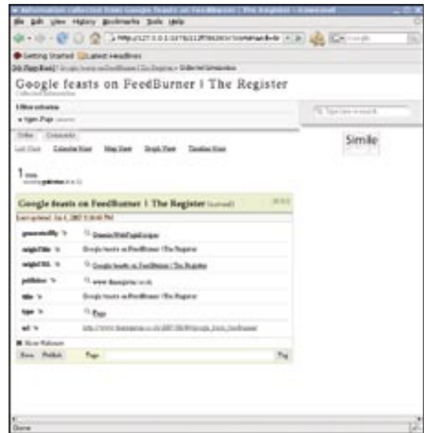
Figure 1: Without a screen scraper, Piggy Bank only discovers a few snippets of information on HTML pages.

of course, infinite. The purpose of RDF technology is not to build a single program that navigates through all natural language alone but to provide a simple