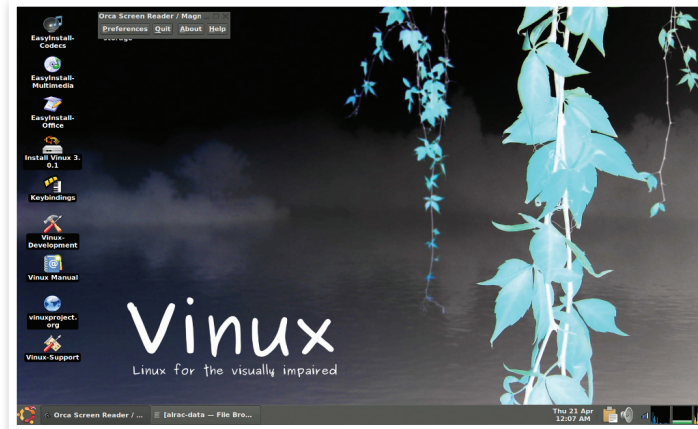
Figure 1: The default Vinux theme is beautiful and comes with full-screen magnification and support for Braille. The Orca screen reader starts by default.

The Orca screen reader is a feature-full Linux application for vision-impaired users, although it’s a long way from being a serious JAWS competitor. Orca began life in 2004 as a Sun Microsystems project, and over time, it acquired fund-