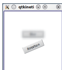
Figure 1: The two animations in action.

show you a practical example of how to use Qt's animation framework, and I'll describe a scenario for integrating multi-touch technology. Unless you're a KDE programmer, you probably won't have to interact directly with these components, but a quick look behind the scenes at how they work will give you some context for understanding the new generation of special effects that will soon begin appearing in future updates of your favorite KDE applications.