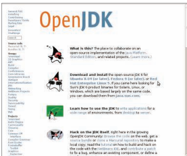
Figure 2: The OpenJDK project is based on Sun's own Java Development Kit.

If you want to experiment with a lesser-known JVM, particularly if it is one of the versions dating to the early 2000s or late 1990s and it was not described in this article, you probably need to roll up your sleeves. Most likely, you won't have OpenJDK available, and you might not have GNU Classpath. If the project doesn't support Classpath or OpenJDK, you might have to settle for a less than complete set of libraries. The good news is, you don't have to play around with these partial solutions unless you really want to – if you do, you probably won't mind wrangling a few Makefiles. ■