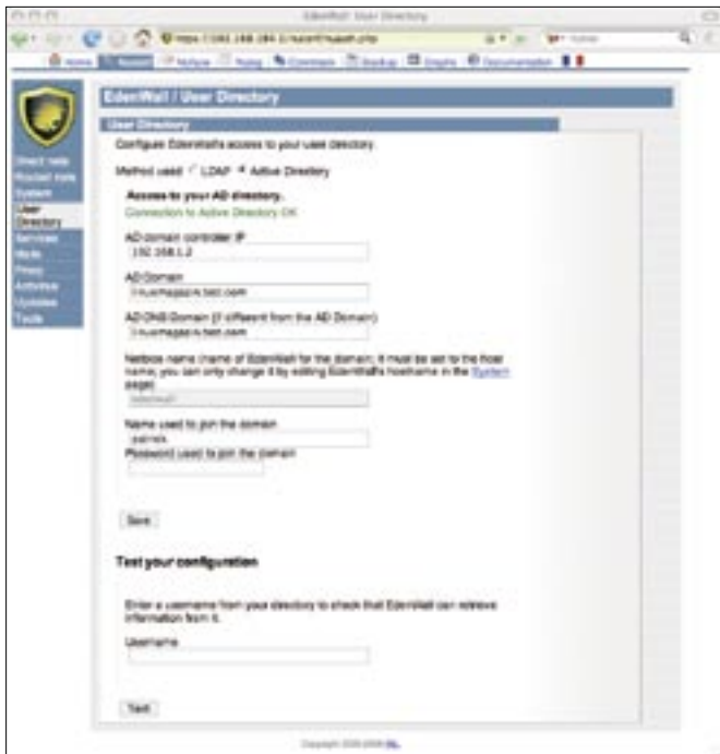
Figure 3: Instead of managing each account, Edenwall references a directory service: The options are LDAP and Active Directory.

NuFW module contacts the NuAuth authentication service to authenticate the packet (step 2). NuAuth uses the existing connection, which was established by the client that sent the SYN packet. NuAuth asks the client to produce valid credentials (steps 3 and 4). If multiple users are working on the same machine, the service asks each client in sequence. This gives NuAuth the ability to validate the credentials passed and, if they are okay, to tell the NuFW firewall software which user it is dealing with (step 5).