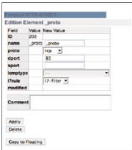
Figure 4: Thanks to an L7 filter, Edenwall can identify not only protocols by their port numbers, but also the data the protocol carries.

Depending on the rule base, NuFW decides whether the packet is permitted