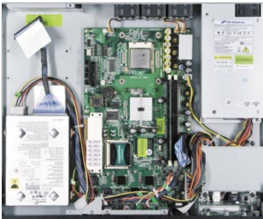
Figure 1: The Edenwall device is by Portwell. The CompactFlash module (bottom center) is used for installation and resetting.

In Layer 3, the Edenwall's rule set supports Network Address Translation (NAT), source and target IP addresses, and protocol and port numbers. We had no trouble setting up support for more