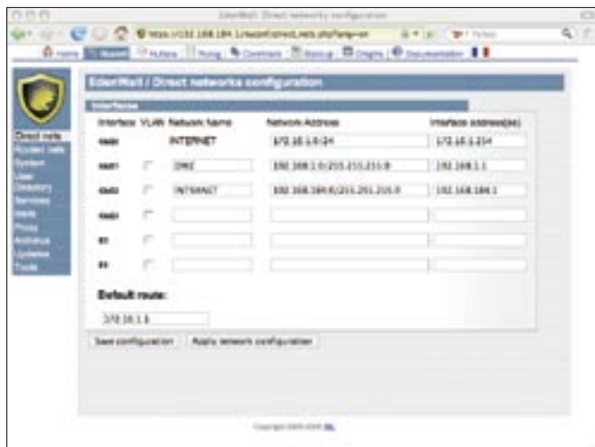
Figure 5: On initial installation, the administrator uses the Nuface GUI to enter critical parameters for the appliance. The external network is always connected to interface GbE0 – an unnecessarily inflexible approach.

address and port number by NAT en route to the Edenwall appliance. With most source NAT configurations on routers, multiple-source IP addresses hide behind a single NAT IP address. A typical NAT implementation will modify the source port of the TCP/UDP packets, making it impossible for NuFW to identify the users.