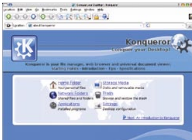
Figure 1: Konqueror after launching without a view profile.

There are numerous ways of starting Konqueror. The icon and the Home entry in the KDE start menu take you to Konqueror in its filesystem browser guise. You can also pop up a quick launch window ( Alt + F2 ), and type an Internet address, to launch Konqueror in web browsing mode. The Internet | Web Browser (Konqueror) entry, or the konqueror command prompt, both take you to Konqueror's new start-up screen (Figure 1). When Konqueror comes up, it gives you links to important places and