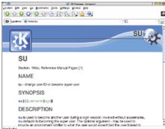
Figure 4: Konqueror as a help center.

actually using one of them right now – help: , which gives you direct access to the KDE Help System. help:ksnapshot takes you to the help files for the KDE screenshot tool. If you are not looking for help on a KDE application, but need the manpage of an infopage for another Unix command instead, there is a kio-slave to handle this task. Type man:/su in the Konqueror location bar to access the HTML version of the manpage for the su command (Figure 4). If the search for a keyword locates multiple manpage entries, Konqueror first shows you a list of possible alternatives. Table 1 has a list