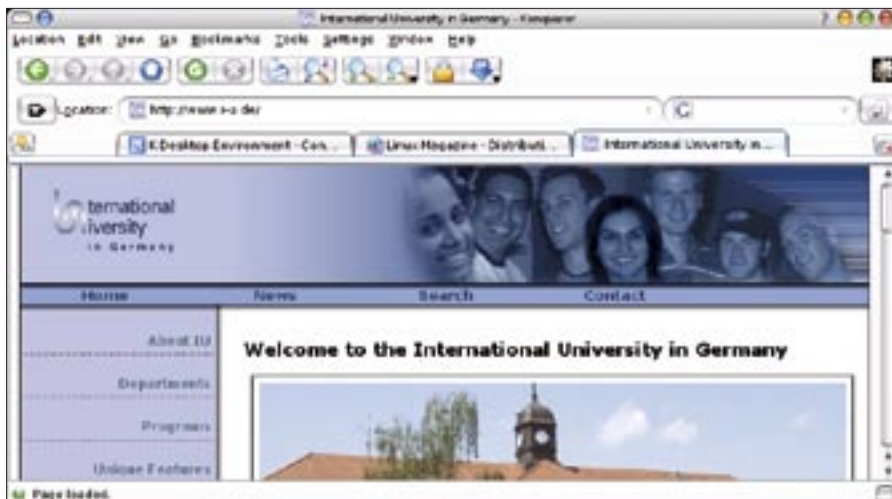
Figure 2: Konqueror in its tabbed web browsing guise.

tasks, allowing you to access both your home directory and the individual KDE Control Center modules.