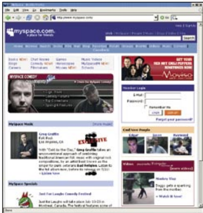
Figure 2: MySpace is popular with some Linux followers who may not be watching the local LUG lists.

Unless you’ve been living under a rock for the past year or so, you will likely