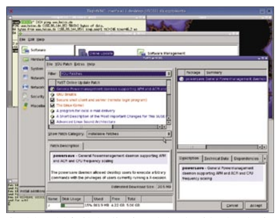
Figure 3: Screenshot of a virtual machine using XVNC. The root user is logged on and running a YaST online update to apply the latest security updates to the virtual machine.

Hotplug is one of the stumbling blocks for production use of Xen. Older distributions use the old hotplug system instead of Udev. The /etc/hotplug/xenbackend.agent file is used instead of /etc/udev/rules.d/40-xen.rules. If hotplug is not configured correctly, an error message is issued. On the upside, if you use the Xen version that came with your distribution, this issue is unlikely to occur.