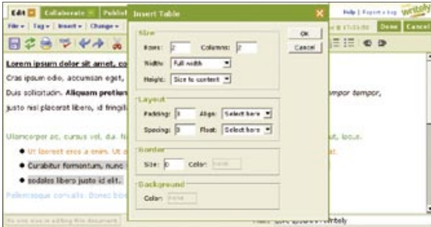
Figure 1: Dialog boxes give the Writely web tool the look and feel of a desktop application.

need to go through tests on three or four popular browsers.