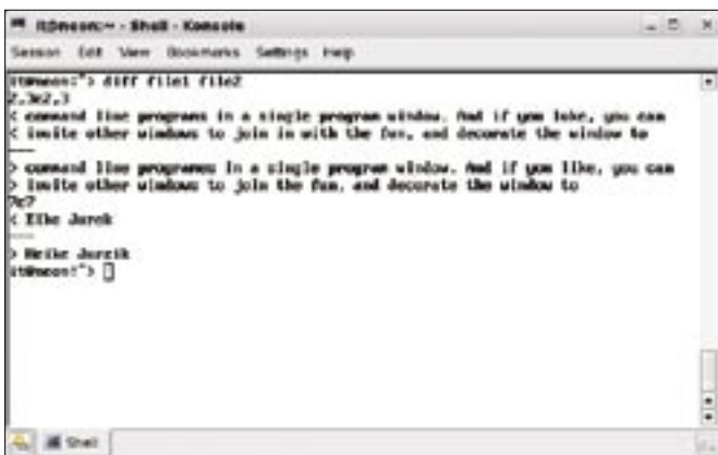
Figure 1: Diff can show you the differences between two text files in the command line.

The Diff program has various other command line parameters to help improve