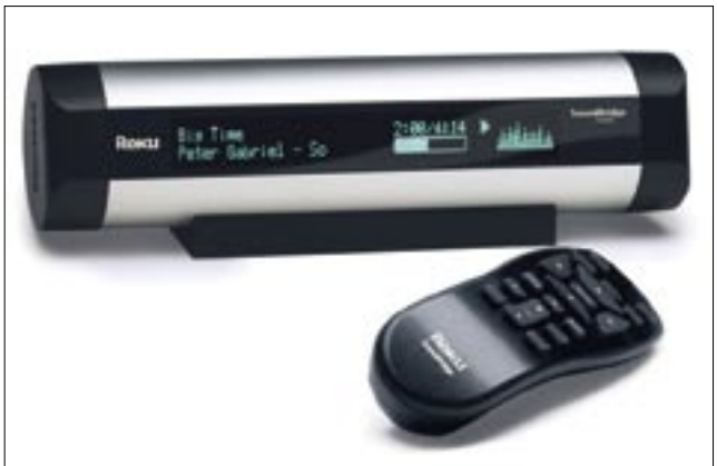
Figure 3: The Roku SoundBridge and Firefly can replace a legacy stereo.

You also need to modify the extensions line in the Firefly server configuration