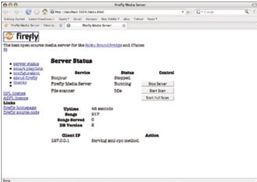
Figure 1: The Firefly web interface supports convenient access to statistics and the music server configuration.

Firefly Media Server on the router, you do not need to run another server machine to access the central audio library from any other machine on the network.