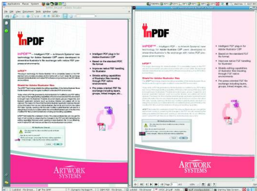
Figure 1: Xpdf likes to keep things uncluttered.

the leading Linux distributors, but only from the Adobe website [1]. The download size is about 50MB. One of the biggest changes is visible from the install. Adobe Reader versions up to and including version 7.0.9 were available as ZIP archives only; users had to first unpack and then install before running an executable script. Now, Adobe offers RPM and DEB binaries of the reader, giving users on many distributions a point and click installation option.