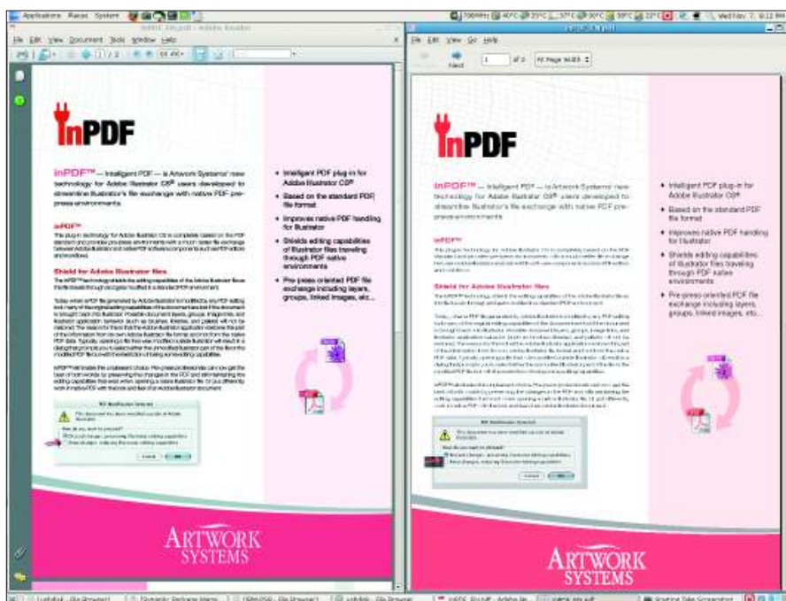
Figure 2: Evince also has an uncluttered program window.

On the other hand, the Xpdf software supports keyboard controls for the most part. Users who are familiar with the keyboard shortcuts can improve speed by doing without a mouse. In a multiple-page document with headings, Xpdf displays the table of contents on the left of the main window. Clicking on a heading