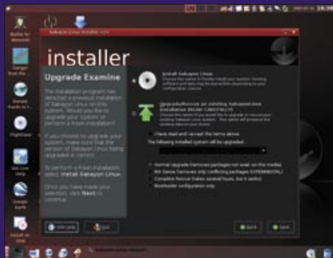
Figure 1: The Sabayon installer offers an easy upgrade option.