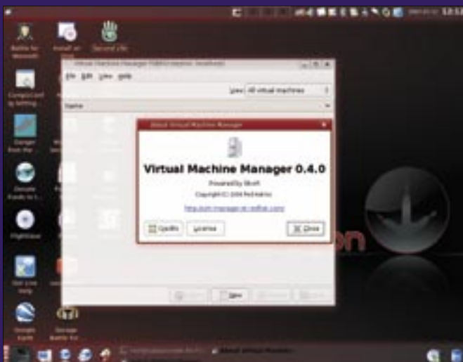
Figure 3: Sabayon also supports a number of virtualization alternatives.

Community support is available through the Sabayon forum: http://www.sabayonlinux.org/forum . You'll find additional tips, documentation, and articles at the Sabayon wiki: http://wiki.sabayonlinux.org .