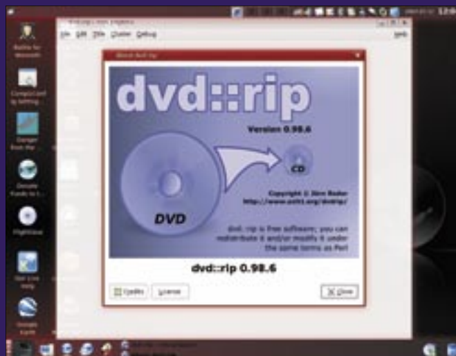
Figure 2: You'll find a convenient collection of desktop tools.