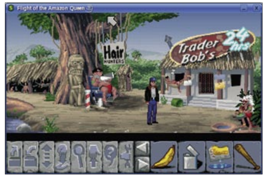
Figure 3: ScummVM brings old adventures back to life by giving them what they need - a script interpreter.

In contrast to this, running a recent version of Ubuntu on QEMU gives you