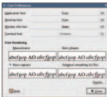
Figure 1: The Font Preferences dialog box in Gnome configures standard fonts.

Gnome programs that use the libraries I just mentioned have an easier job of font handling by using a standardized mech-