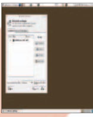
Figure 2: Network settings in Ubuntu.

The first user created on the system is permitted to sudo any tasks typically restricted to the root user. As a compromise between convenience and security, this user is prompted to supply his or her password the first time he or she calls sudo . The password is then stored in memory for five minutes. To enable the root account, all you need to do is to set a password by typing sudo passwd root .