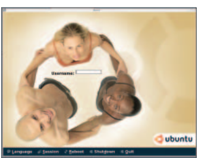
Figure 4: The Ubuntu philosophy is reflected in Ubuntu's artwork.

The main repository is so spartan that most users will be forced to resort to the universe repository sooner or later. This means losing some of the advantage over using Debian Sarge in the testing phase. Canonical will need to move a few packages from universe to the main repository to give users a complete desktop system. This said, Ubuntu is a great alternative for fans of Debian who need a convenient way of adding proprietary packages to their systems. And the latest Gnome desktop, accompanied with excellent artwork, puts Ubuntu in a class of its own.