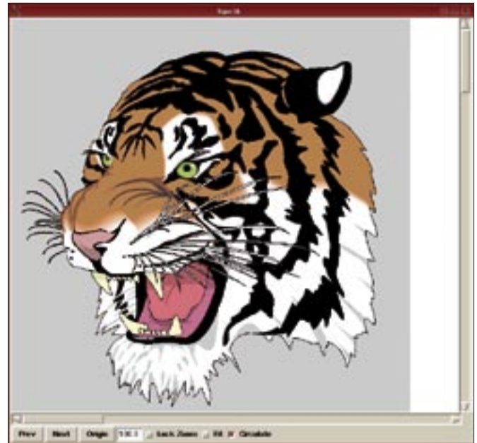
Figure 3: The tiger as a Tk program. pstoedit not only converts Postscript into other image formats, it also gives you Tk applets.

Before you launch into the pstoedit install, first download the sources from [4]. After unpacking the archive, edit the configure file, changing the following line: