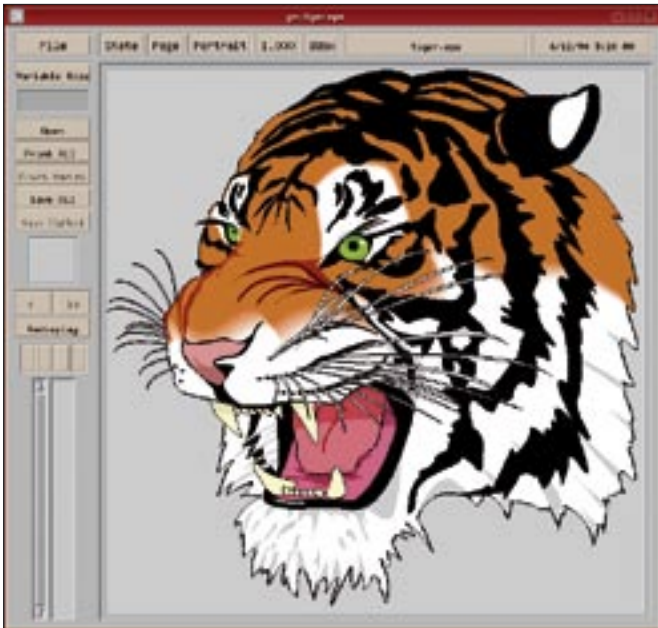
Figure 1: We'll use this Postscript tiger to experiment with some pstoedit features.