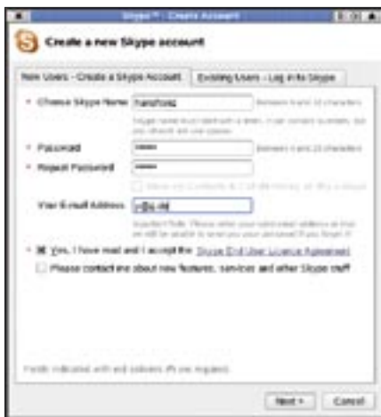
Figure 2: New to Skype? You need to register first. To do so, enter your name, an email address, and a password.

though it must be said that the connection usually works without changing any settings. You may experience an echo during voice communications, but you can reduce this echo by reducing the microphone volume.