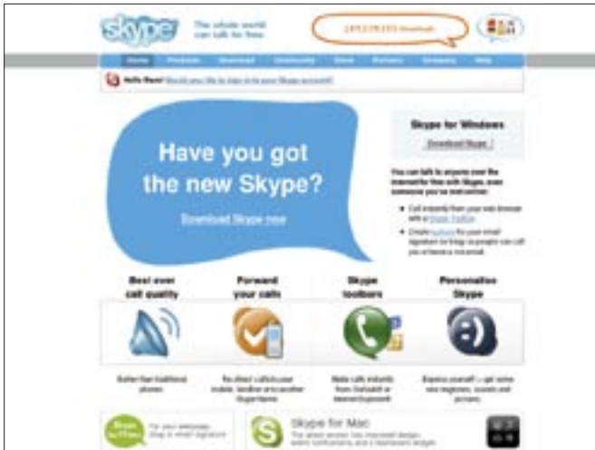
Figure 1: You can download Skype on the Internet for no charge.