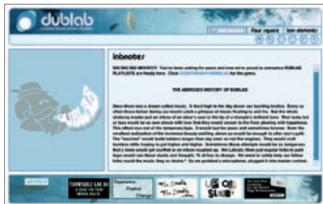
Figure 2: Dublab.com is always good for a musical surprise.