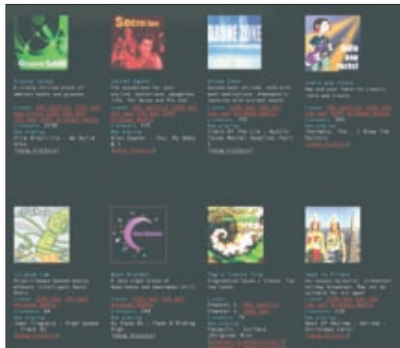
Figure 1: Soma.fm has eight streams to cater to a wide range of musical tastes.

Soma.fm, from the homeland of Internet dreams, is an Internet station that provides a variety of streams to suit different tastes. The servers are located in a cellar in San Francisco's South Of Market area, which explains the idiosyncratic name. The musical repertoire covers everything from Ambient ("Groove