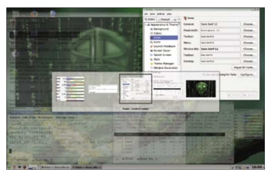
Figure 3: The Switcher plugin with live thumbnails of applications.

poses a number of technical issues and is typically unintuitive.